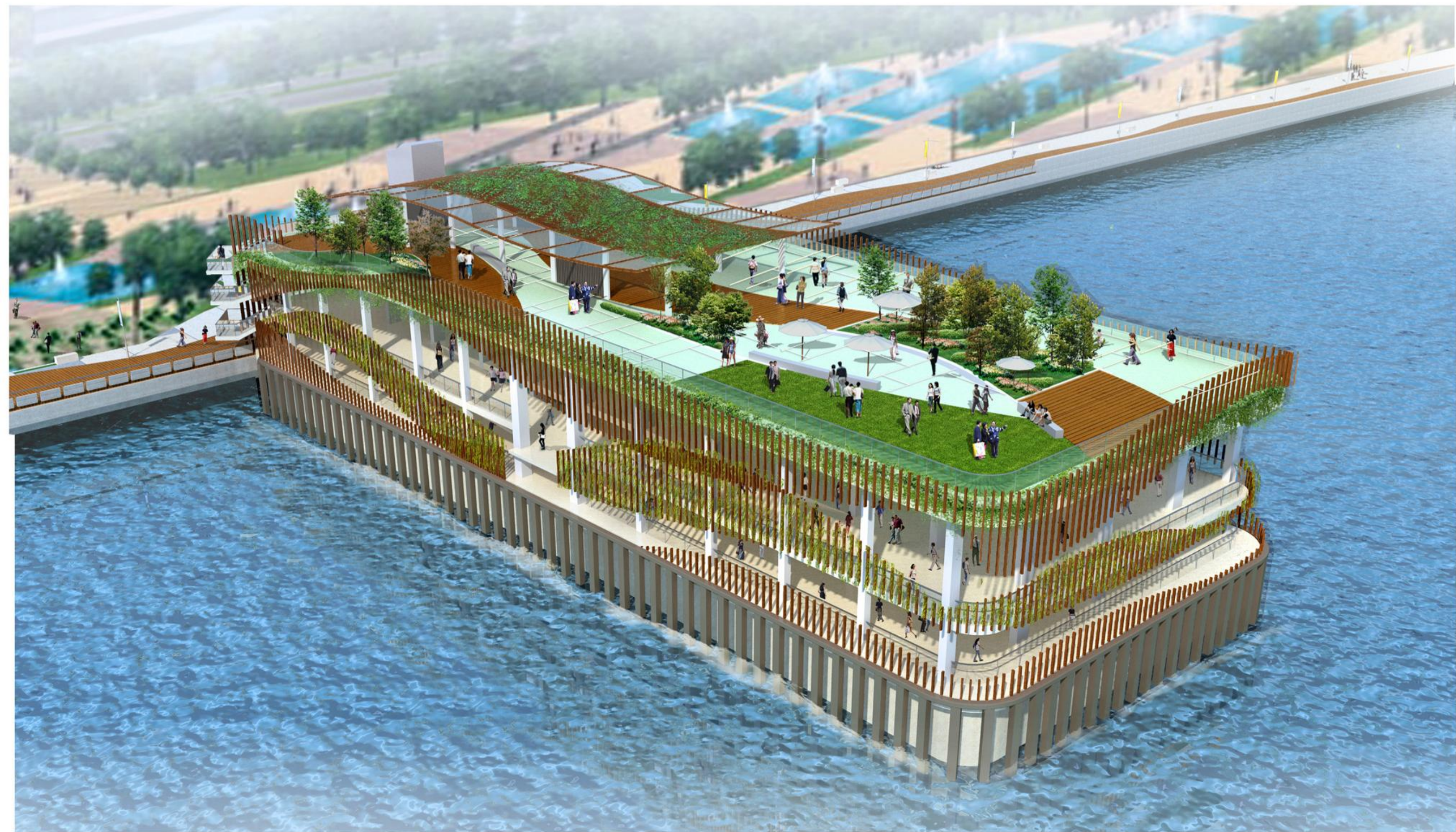
View of the Re-provisioned Wan Chai Ferry Pier (Exterior Design Option1) 重置的灣仔渡輪碼頭視點 (外觀設計方案一)