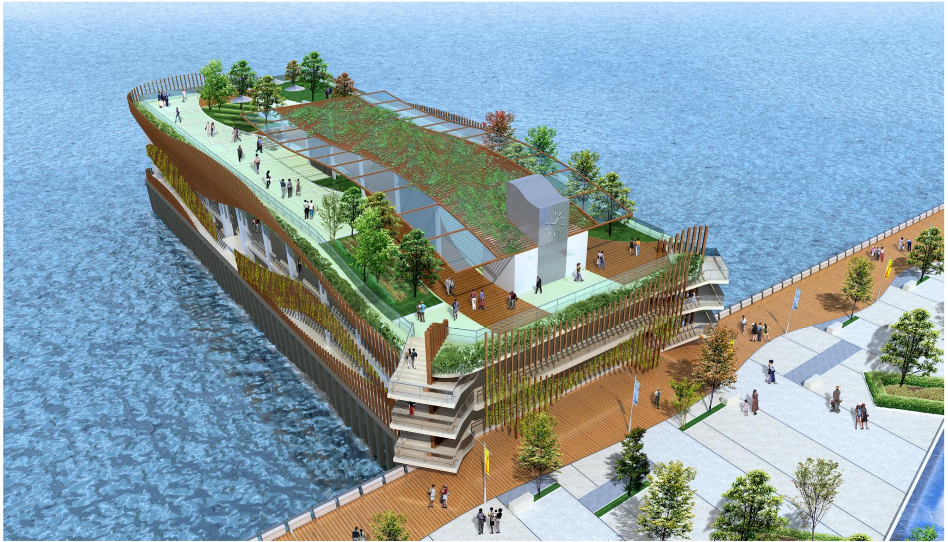
Entrance View of the Re-provisioned Wan Chai Ferry Pier (Exterior Design Option1) 重置的灣仔渡輪碼頭入口立面圖 (外觀設計方案一)