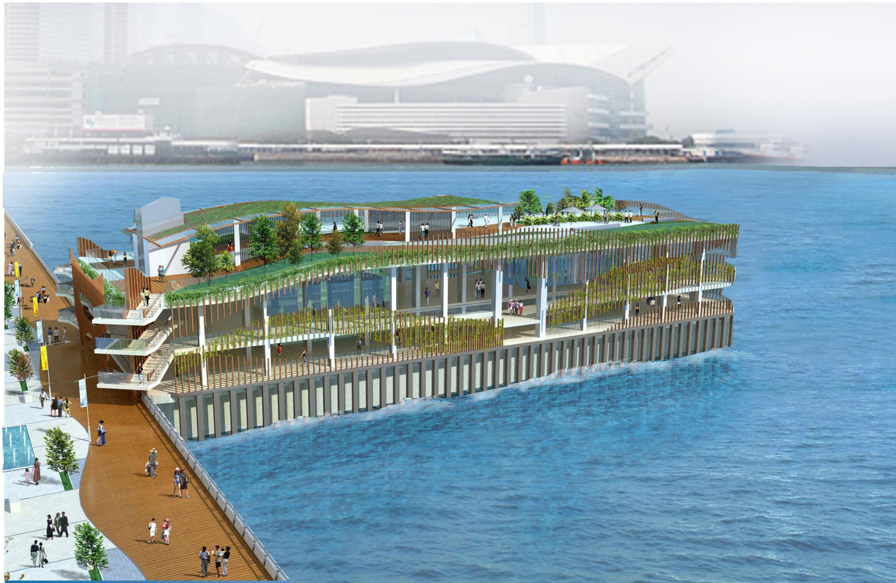
Eyelevel View of the Requisitioned Wan Chai Ferry Pier (Exterior Design Option1) 重置的灣仔渡輪碼頭水平視點 (外觀設計方案一)