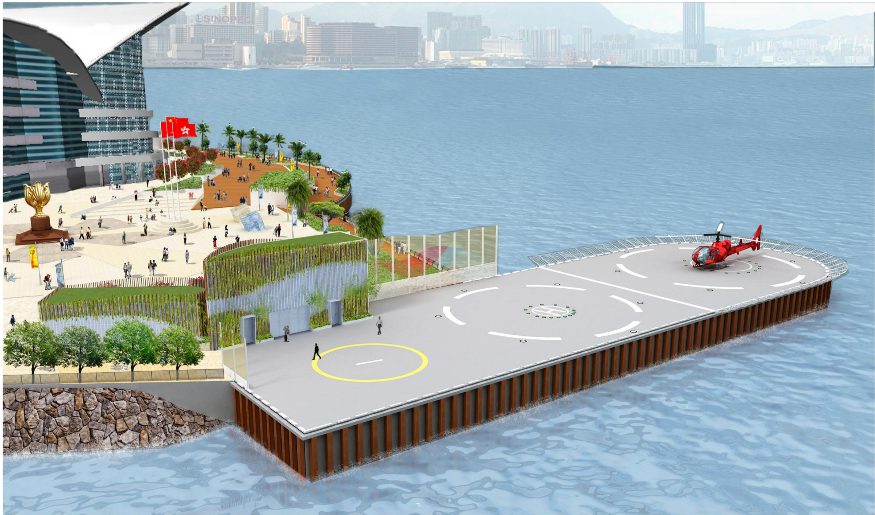
Eastern View of Permanent Government Helipad (Exterior Design Option1) 政府直昇機坪的東面視點 (外觀設計方案一)