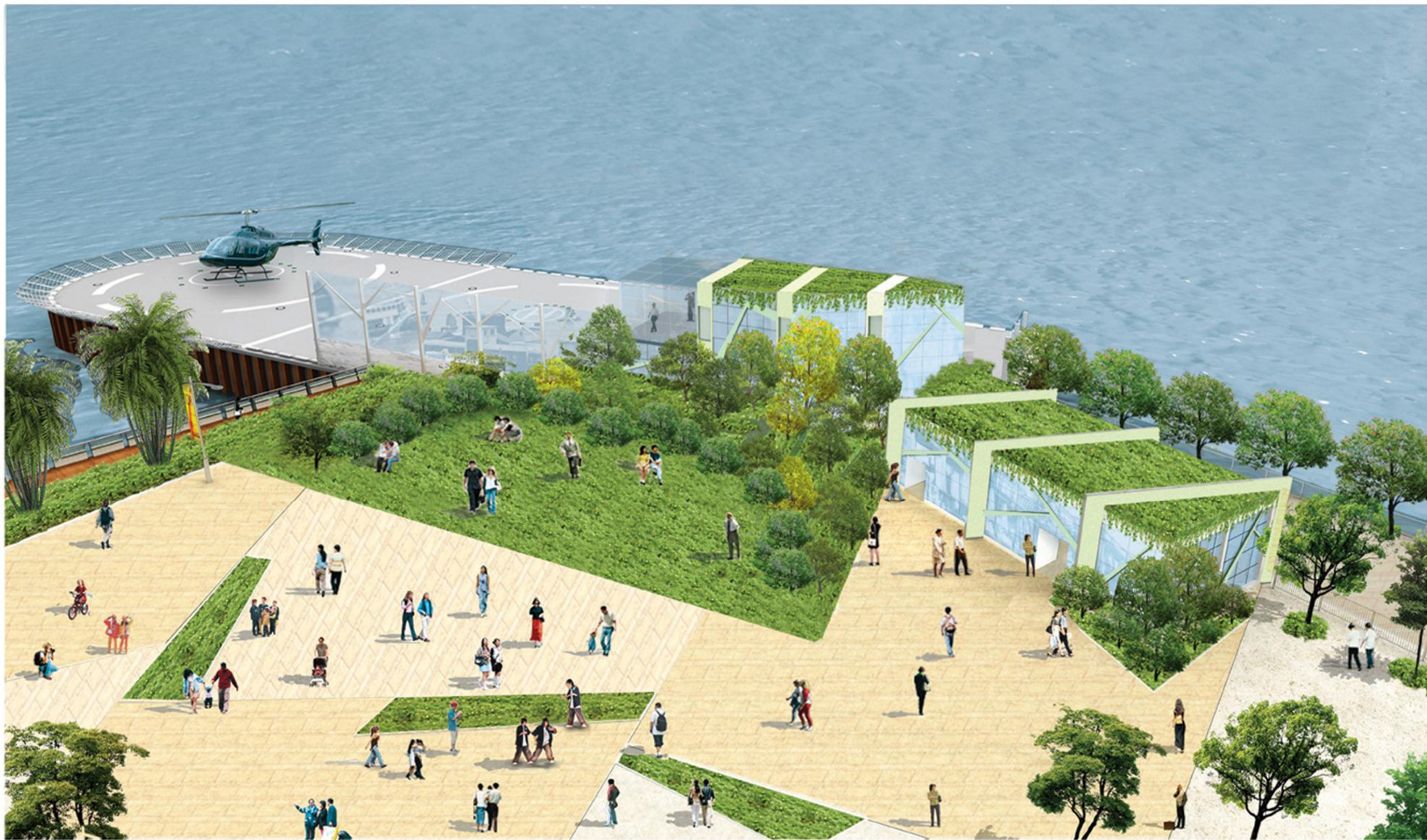
Western View of Permanent Government Helipad (Exterior Design Option2) 政府直昇機坪的西面視點 (外觀設計方案二)