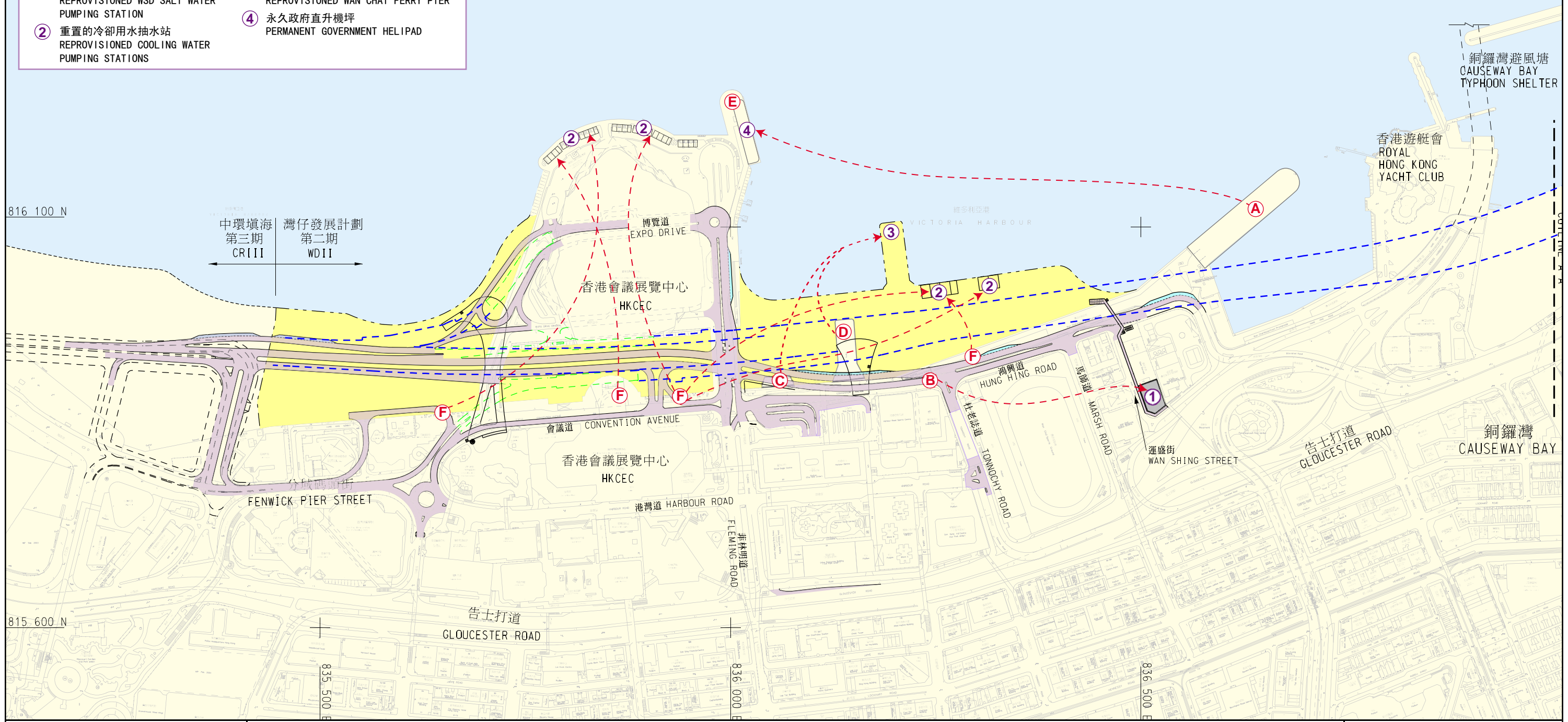
現有灣仔海濱需要拆卸及重置的設施位置圖 Location Plan for Major Re-provisioned Waterfront Facilities