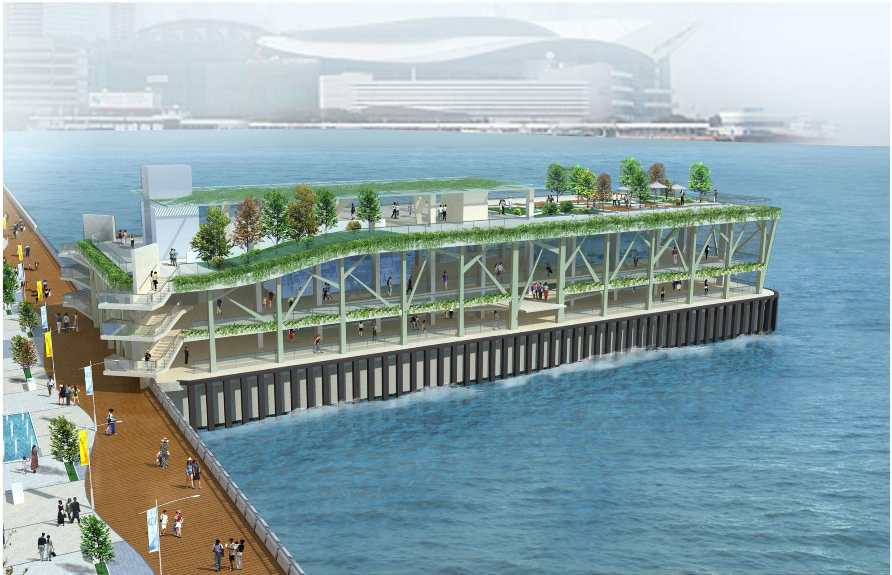
Eyelevel View of the Re-provisioned Wan Chai Ferry Pier (Exterior Design Option2) 重置的灣仔渡輪碼頭水平視點 (外觀設計方案二)