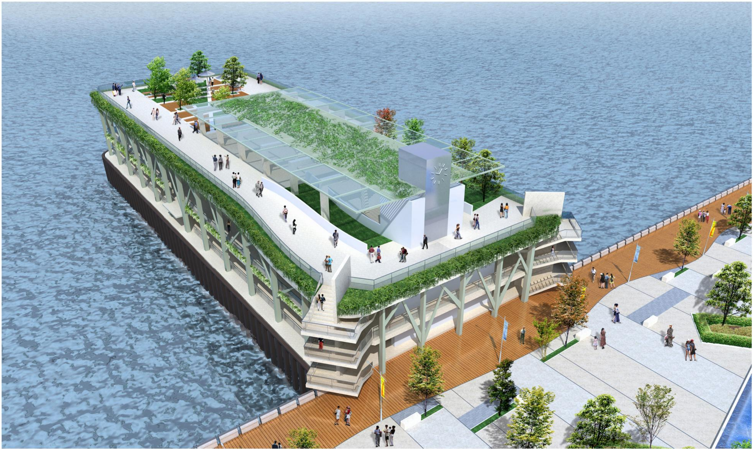
Entrance View of the Re-provisioned Wan Chai Ferry Pier (Exterior Design Option2) 重置的灣仔渡輪碼頭入口立面圖 (外觀設計方案二)