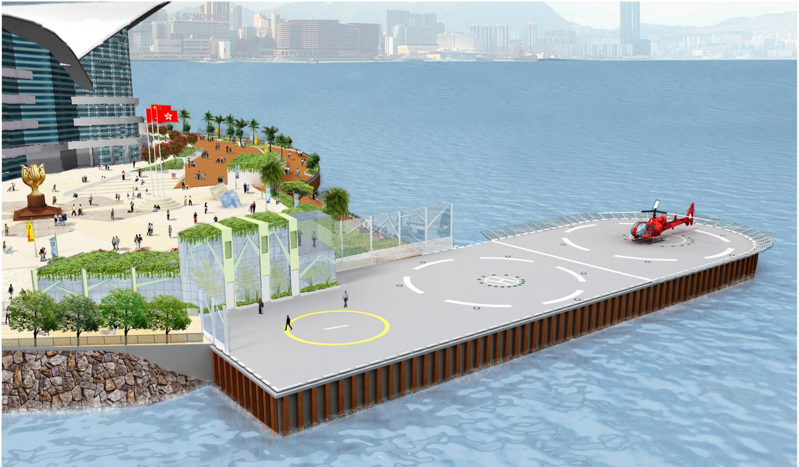
Eastern View of Permanent Government Helipad (Exterior Design Option2) 政府直昇機坪的東面視點 (外觀設計方案二)