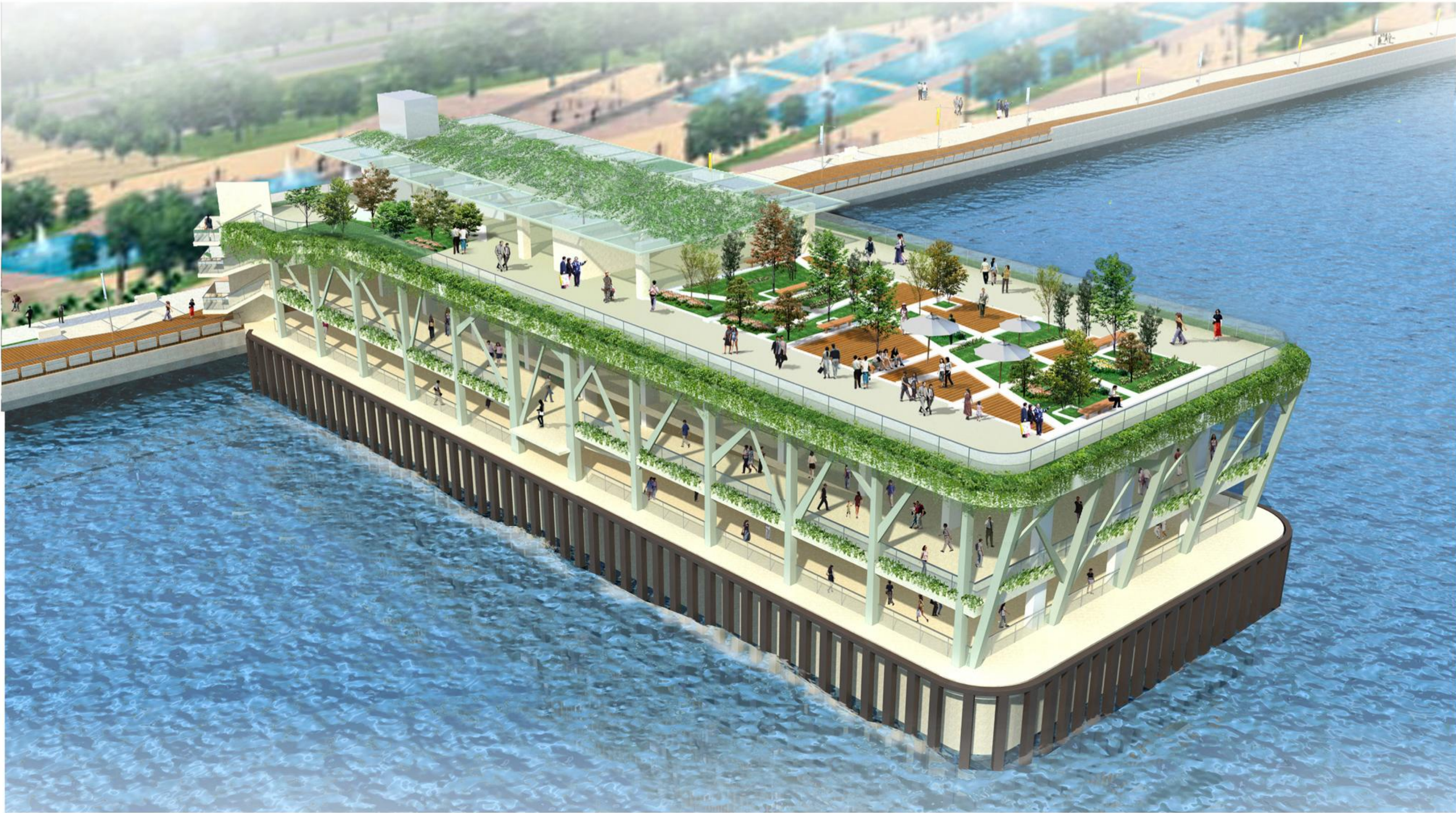
View of the Reprovisioned Wan Chai Ferry Pier (Exterior Design Option2) 重置的灣仔渡輪碼頭視點 (外觀設計方案二)