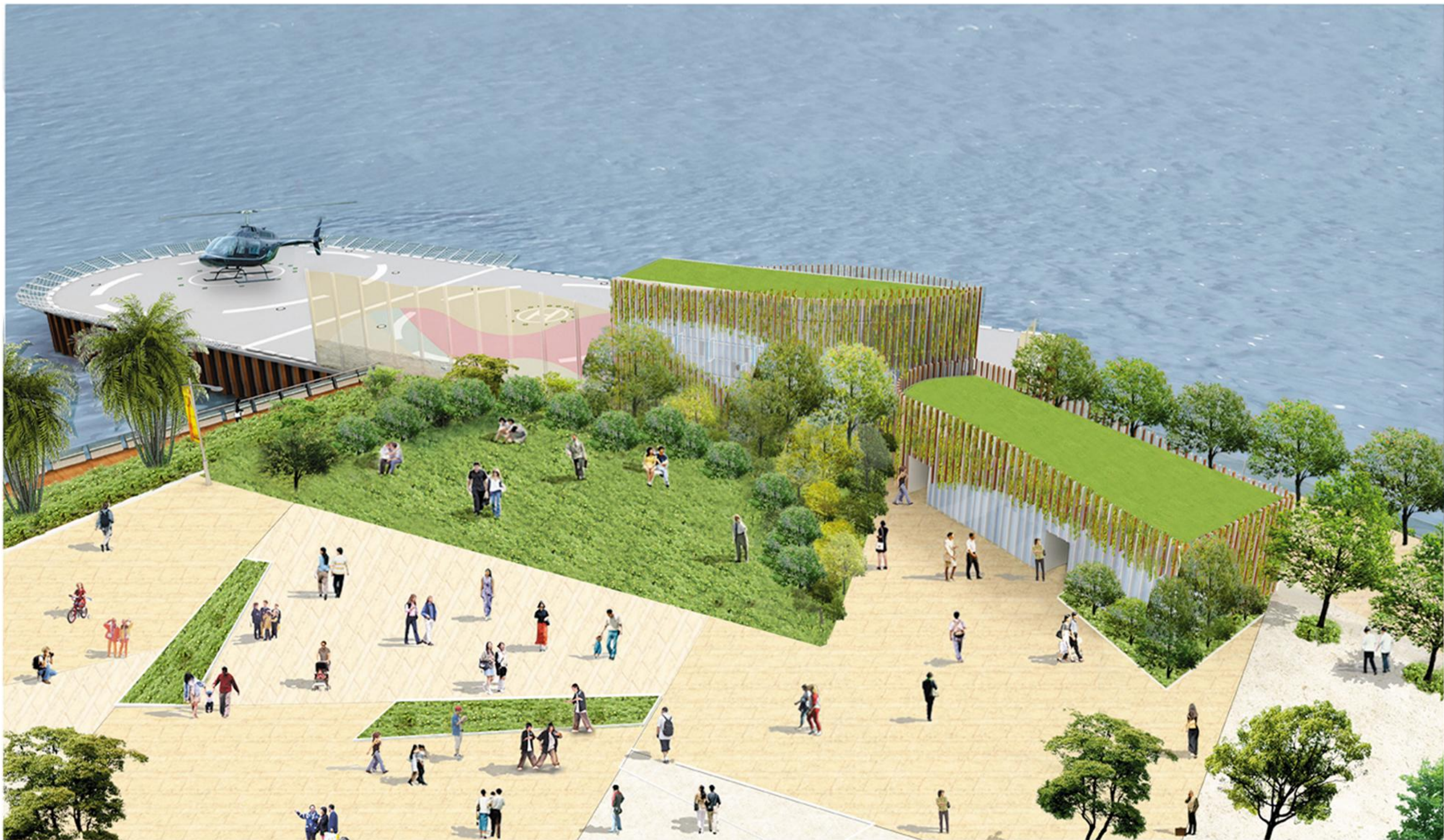
Western View of Permanent Government Helipad (Exterior Design Option1) 政府直昇機坪的西面視點 (外觀設計方案一)